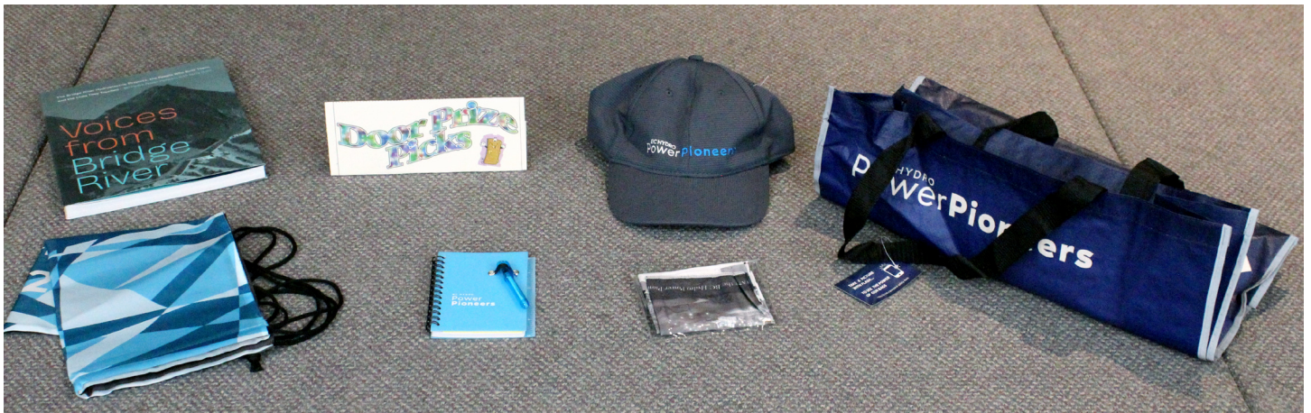
April Door Prizes

Six door prizes were claimed altogether worth approximately $70.00. In case you didn't win: Did you know you can buy these and other merchandise on line from the Power Pioneer's Gear Store? Point your browser to: https://powerpioneersgear.com/