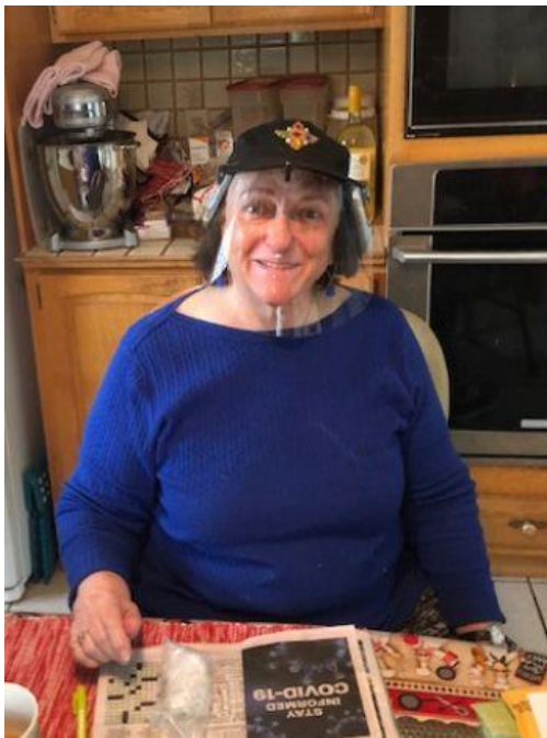
This style is a baseball cap shield.

Click here for an interesting article on shields.