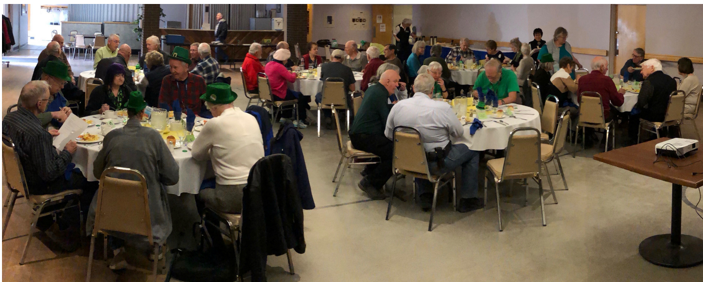
March 14 th SIPP Luncheon at the Emerald Room, Schubert Center, Vernon.

May you spend half an hour in heaven before the devil knows you're dead! – Irish proverb