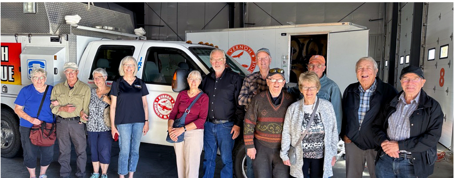
Friday, October 6, twelve pioneers enjoyed a private tour of the newly minted VSAR facility.