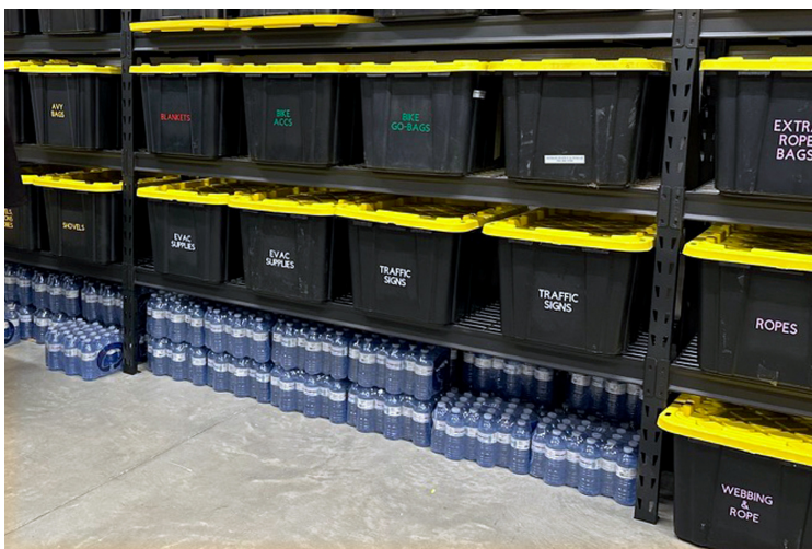
Wall of storage