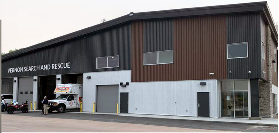
5150 Silver Star Road

Friday, October 6, Leigh Pearson of Vernon Search and Rescue gave us a very interesting tour of their new facility at 5150 Silver Star Road. The new building consolidates all their equipment securely under one roof. Also the spacious two-story building includes two training rooms, a boardroom, and a state-of-the-art command centre. The high ceiling in the ten vehicle bays also serves for rope