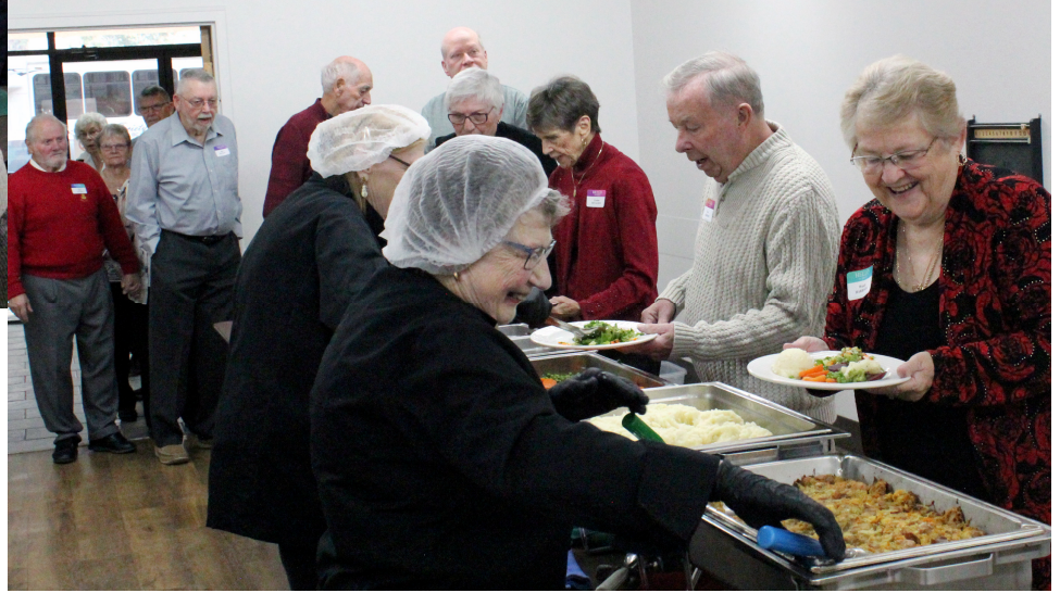
The hungry hoard queues up.

Self-serve dessert table included plum pudding, assorted pastries, and a fruit platter.