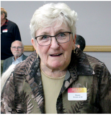
Our Mother Hen!