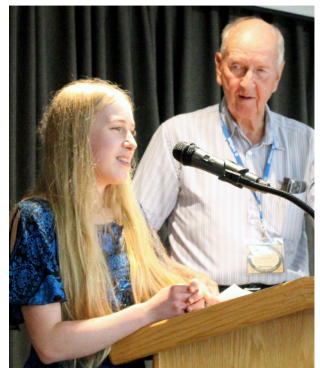
Finally I have a cheque for $500 with no strings attached. Spend it as you see fit.**